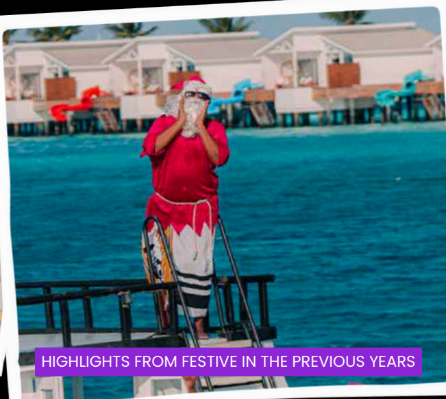
HIGHLIGHTS FROM FESTIVE IN THE PREVIOUS YEARS