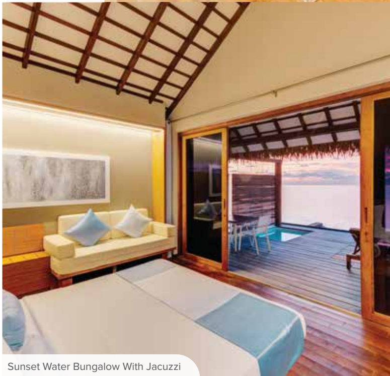
Sunset Water Bungalow With Jacuzzi