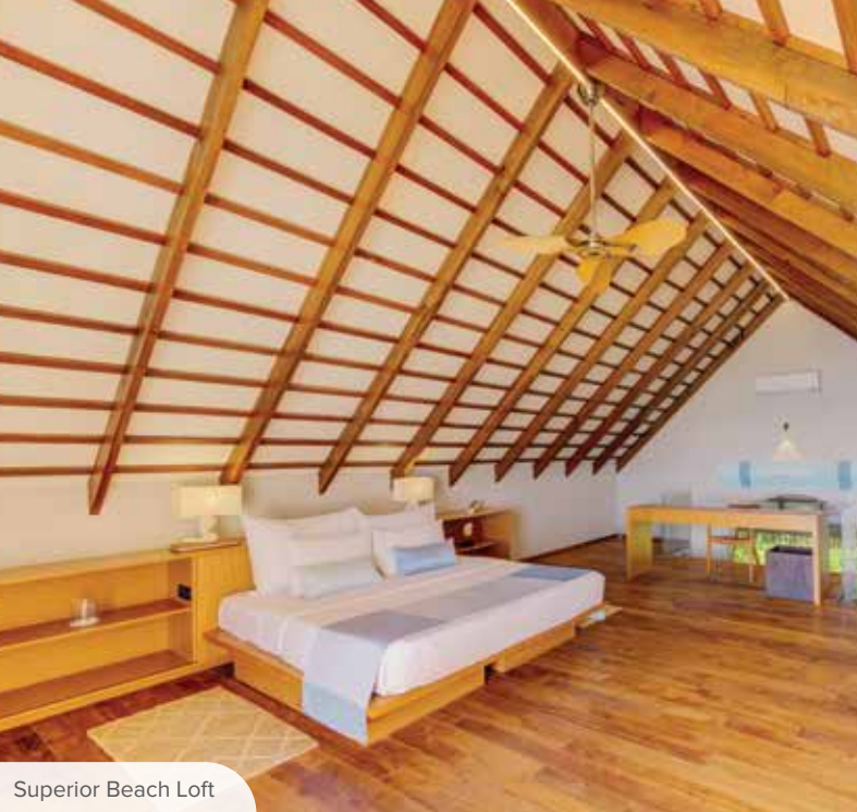
Superior Beach Loft