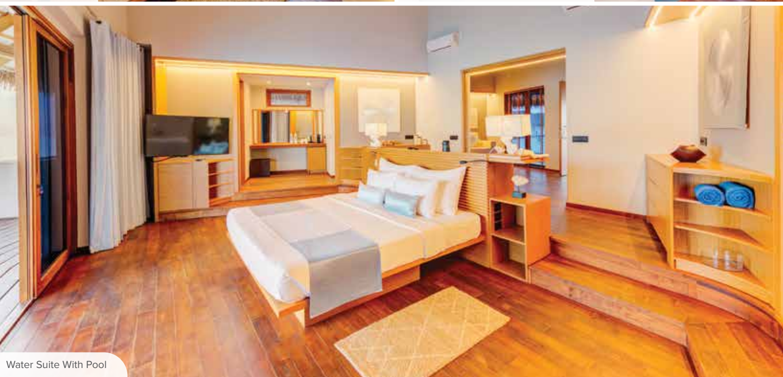
Water Suite With Pool