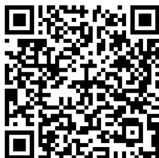
Menus A La Carte Restaurants

Guest rooms: Please use the room bins only for mixed/general waste and please kindly place your recycling waste to the side of the bins or dispose in the recycling bins located throughout the hotel's public areas.