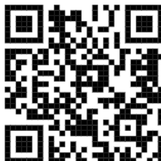
Reservation A La Carte Restaurant