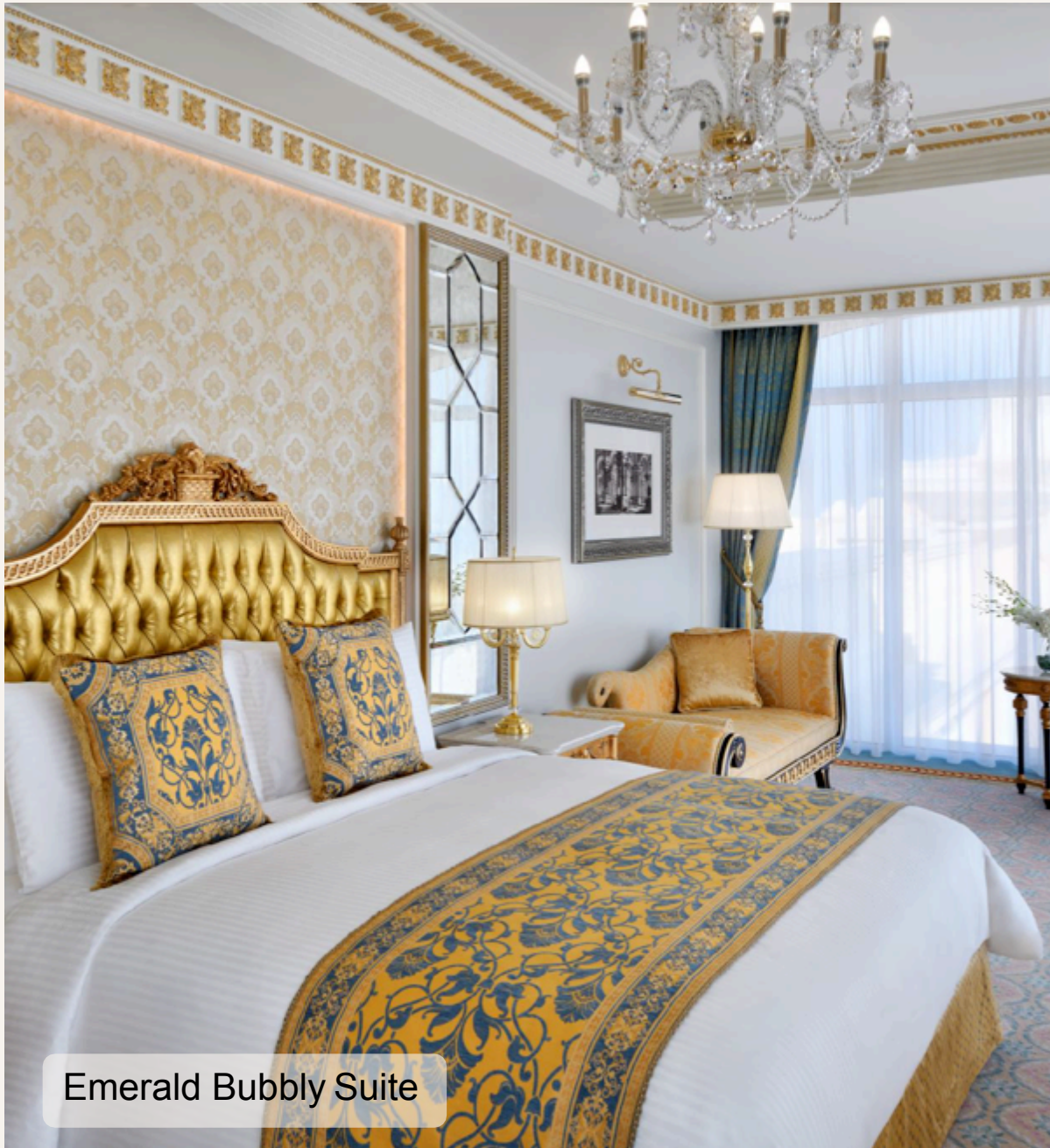
Emerald Bubbly Suite